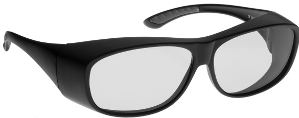
#51 Medium / #53 Large Universal