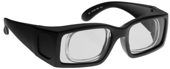
#55 Wraparound w/Insert